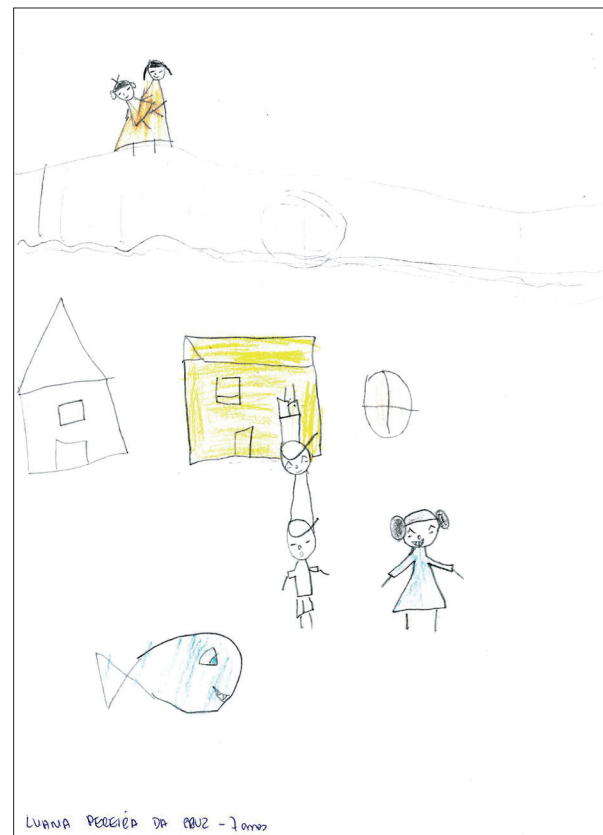
Figure 1: Drawing by Nana, 7

The influence and heritage of Japanese culture in Brazil, was reflected in the drawings of many Brazilian children who included details such