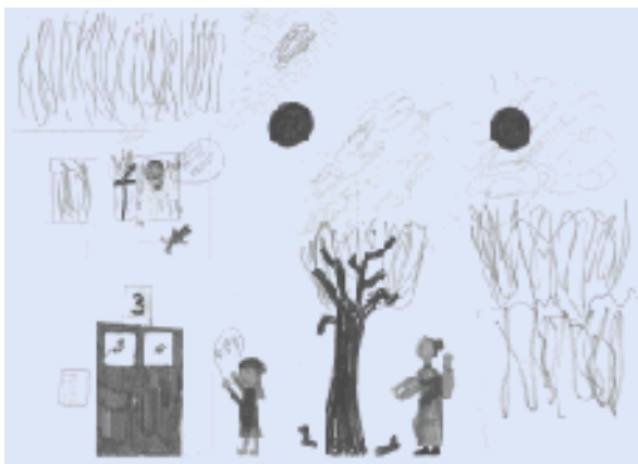
Fig. 7: Linda (10): A mother alight in a burning house throws a teddy down to her daughter, saying her final goodbye.

Arrows characterised the actions of shooting, fleeing, being injured (wounds spurting blood) and suffering. Where battle scenes were the main focus of the picture, the pictures mostly showed two warring parties, often man against man or group against group. They were images of close combat in which people with drawn pistols were shooting at each other. The children's images of war were probably based on fictional television scenes which had been adapted to the current situation, for example by adding green combat uniforms. Battle scenes were, however, also depicted as a scenario devoid of humans. Planes dropped bombs on houses or, as in three pictures, flew into high-rise buildings. Images of night attacks seemed to be mixed with definite relics of the media coverage of the events of September 11. In terms of appearance and size, the skyscrapers and planes resembled the pictures from New York more than the reality in Baghdad. Bombs were drawn either as very round, like cannon balls, or as longer objects labelled "guided missiles". Other weapons were depicted in the drawings, for instance that of Steven (10) contained a square box with a round symbol on it being dropped from an aeroplane, which he explained was a "nuclear warhead". This is another example of how the