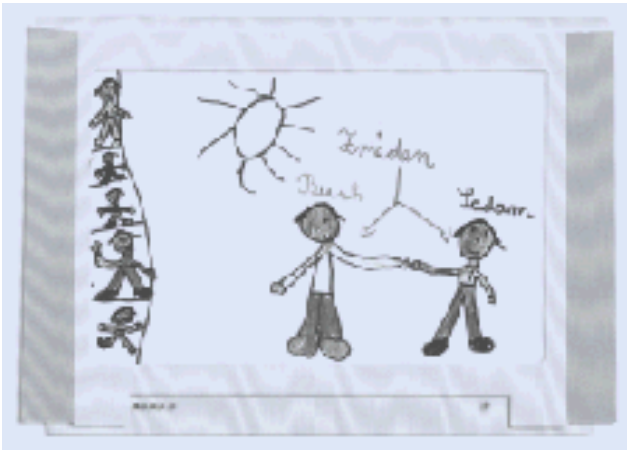
Fig 4: Monique (8) wants Bush and Hussein to shake hands. The other presidents applaud.

"I really liked the fact that some people went on demonstrations and they were shouting: 'No war!'" (Charly, 9)