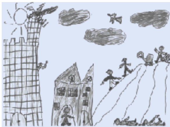
Fig. 8: Monique's (8) picture of the Iraq War: the Americans set a lethal trap.

In her picture she drew a stone tower which she described as a bunker. There are bars on the windows so that no bombs can enter. The attackers are standing on a hill, although two