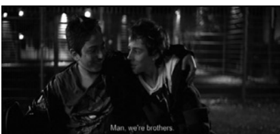
Ill. 8: Umut asks: Can a Turk adopt a German? Yes!

The Australian youth jury praised the actors and found the story to be especially well-made and well-thought-out: “It was a good movie. That’s why you remember it.” For them, the humour was exceptional, and surprisingly different: “Really creepy, but funny.”