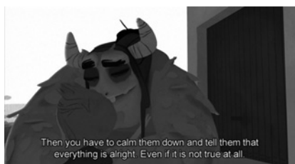
Ill. 6: Meeting the boy's beast father upsets the beast mum