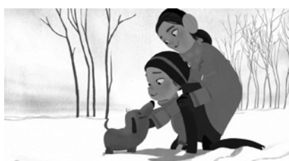
Ill. 7: Finally, the mother has turned back into her own self