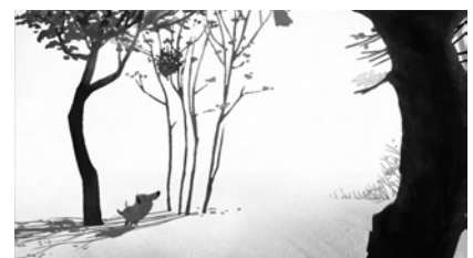
Ill. 1: In the park, a little boy sees a dog and wants to play with it

They discussed the target audience of the program and the fact that it was well received by both children and adults. "I think this will work for over-preschool as well" (male expert, USA). The broadcaster of the program who was present among the audience affirmed this: "In ZDF, we have this structure that if employees go through divorce, they have some sort of social counseling. They are using that film as well for that purpose. It turns out that a lot of adults can relate to it." (female expert, Germany)