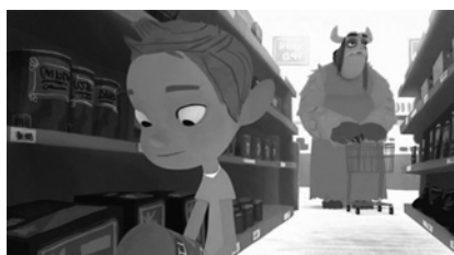
Ill. 3: The boy has to take charge of his mother in the supermarket