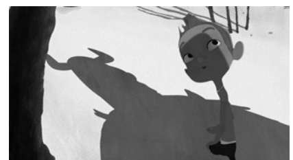
Ill. 2: The boy's mother is a beast and scares the dog away