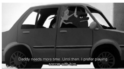
Ill. 8: The boy's beast father needs some more time to "de-beast"

Some were confident that the program had a universal appeal and should not be restricted to dealing with divorce alone. "I thought it was so real. I think you can relate it to other issues: alcoholism, dysfunctionality, depression, and even things that are not bad things that cause a transition." (female expert, USA)