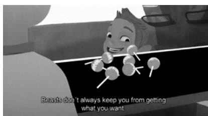
Ill. 4: He buys candy, and his apathetic beast mum doesn't notice