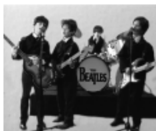
Mobile Library (KTV Kenya) The Inventor (MTV Mongolia) Beatles (NRK Norway)

ned for the near future; discussions with the Arab States Broadcasting Union (ASBU) are already under way.